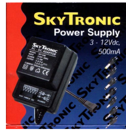
Power : 12V 500mA